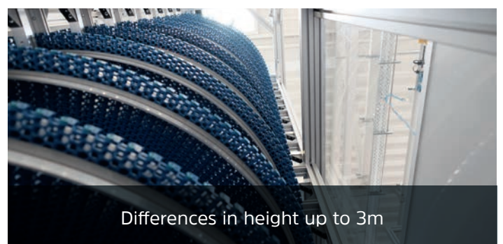
Differences in height up to 3m