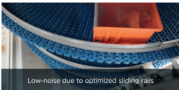
Low-noise due to optimized sliding rails