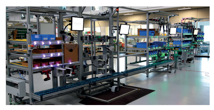
One-Piece-Flow assembly line for office furniture